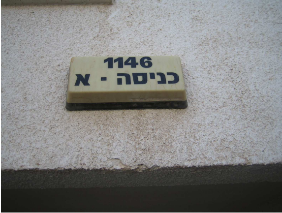
Hebrew entrance sign (entrance “alef”) of 1146 Sheshet HaYamim.

The second apartment is 603 on Eilot Street, Apartment No. 7 (see map below).