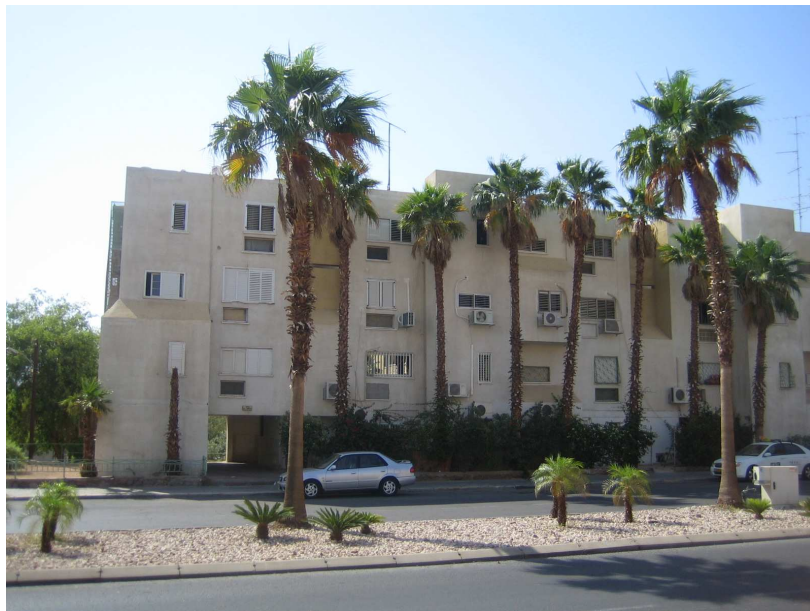
View of Apartment 1146 building on Sheshet HaYamim.